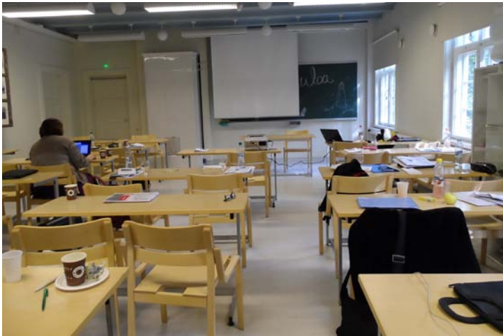
Der Seminarraum auf der Insel Repposari.