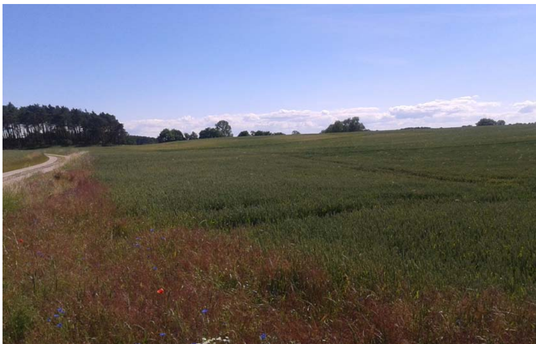
Mecklenburg-Vorpommern „Weiße Strände – weite Felder – wenig Handyempfang. Ein Land der Ruhe und Entspannung.“