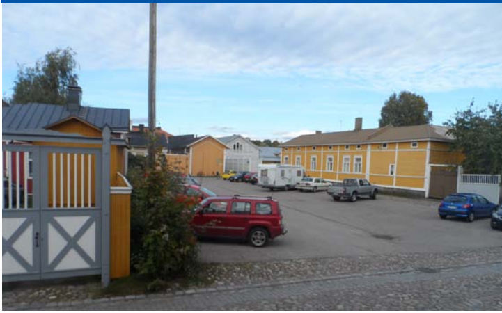
Blick die Altstadt von Rauma.