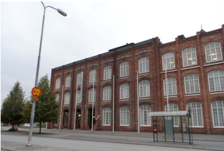
Das Universitätszentrum in Pori.

man Schatz. 1 Der Blick aus dem Fenster bestätigte die dargebotene Landschaftsbeschreibung: Bäume und Granit.