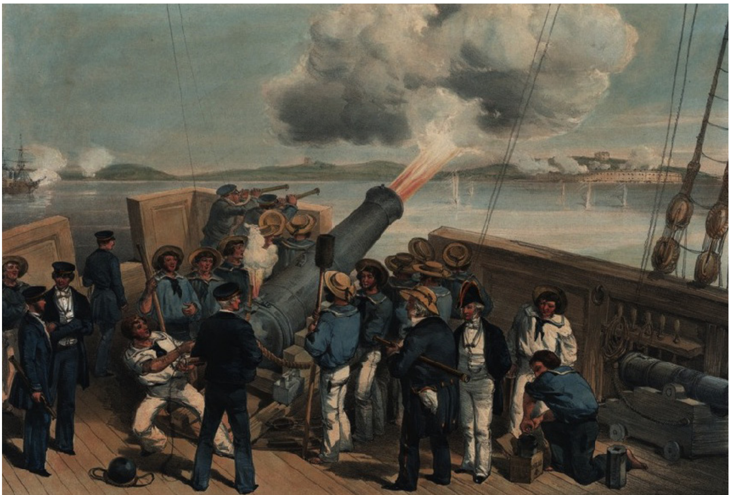
During the Crimean War 1853-1856 the Baltic Sea became a theater of war too. William Simpson's painting shows the bombardment of Russian Bomarsund fortress on Åland Islands by combined British and French navy forces.

Also the addressed economical challenges in the BSR - the lack of structural reforms in Russia and the energy supply interdependence - leave room for interpretation. While some economic consultants with close ties to the Russian government speak of a flourishing economy the majority